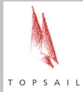
Wedding photography - www.guytimewell.co.uk